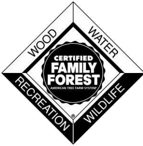
Wood Water Wildlife Recreation Certified Family Forest™