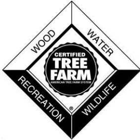
American Tree Farm System®

The American Forest Foundation, Inc. (AFF) is the owner of the following three service and collective marks (hereafter referred to as the "marks/registered marks").