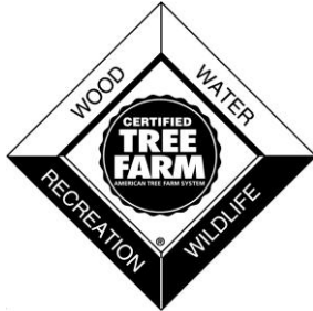
American Tree Farm System®

The American Forest Foundation, Inc. (AFF) is the owner of the following three service and collective marks (hereafter referred to as the “marks/registered marks”).