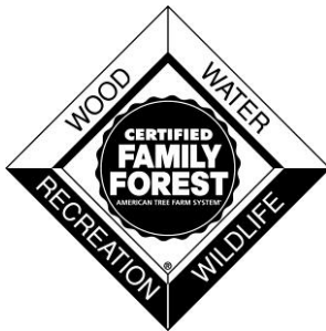
Wood Water Wildlife Recreation Certified Family Forest™